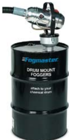
3290/4180 HighJet/SewrJet DM

Mechanically identical to our 6329 model, but includes a one-turn control valve to adjust liquid output and droplet size (intermediate fog to heavy wet fog). The dispensing rate can be calibrated in the field. Extensively used for odor control in solid waste transfer stations,