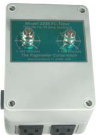
2238 REPEAT CYCLE TIMER

cycles (1-100 minutes each) are set with 1-turn knobs. Compatible with all foggers. International plugs and receptacles available. 120 VAC (P/N 223810); 240 VAC (P/N 223820)