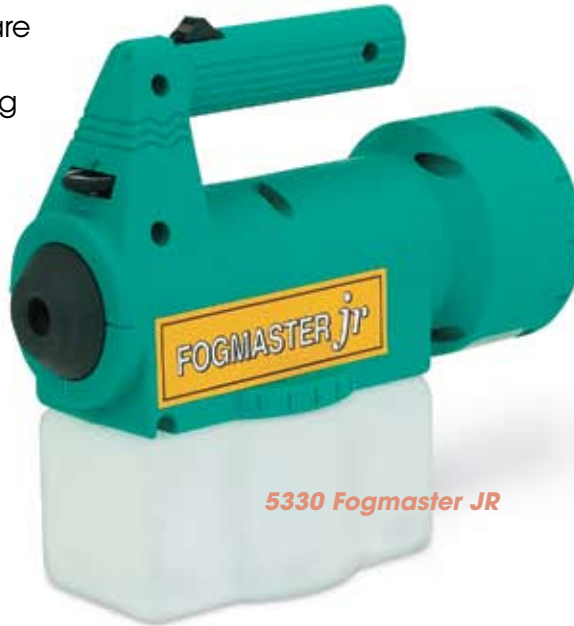
5330 Fogmaster JR

It has a 1-quart tank, a discharge range