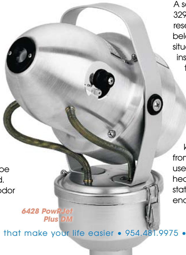
6428 PowRJet Plus DM