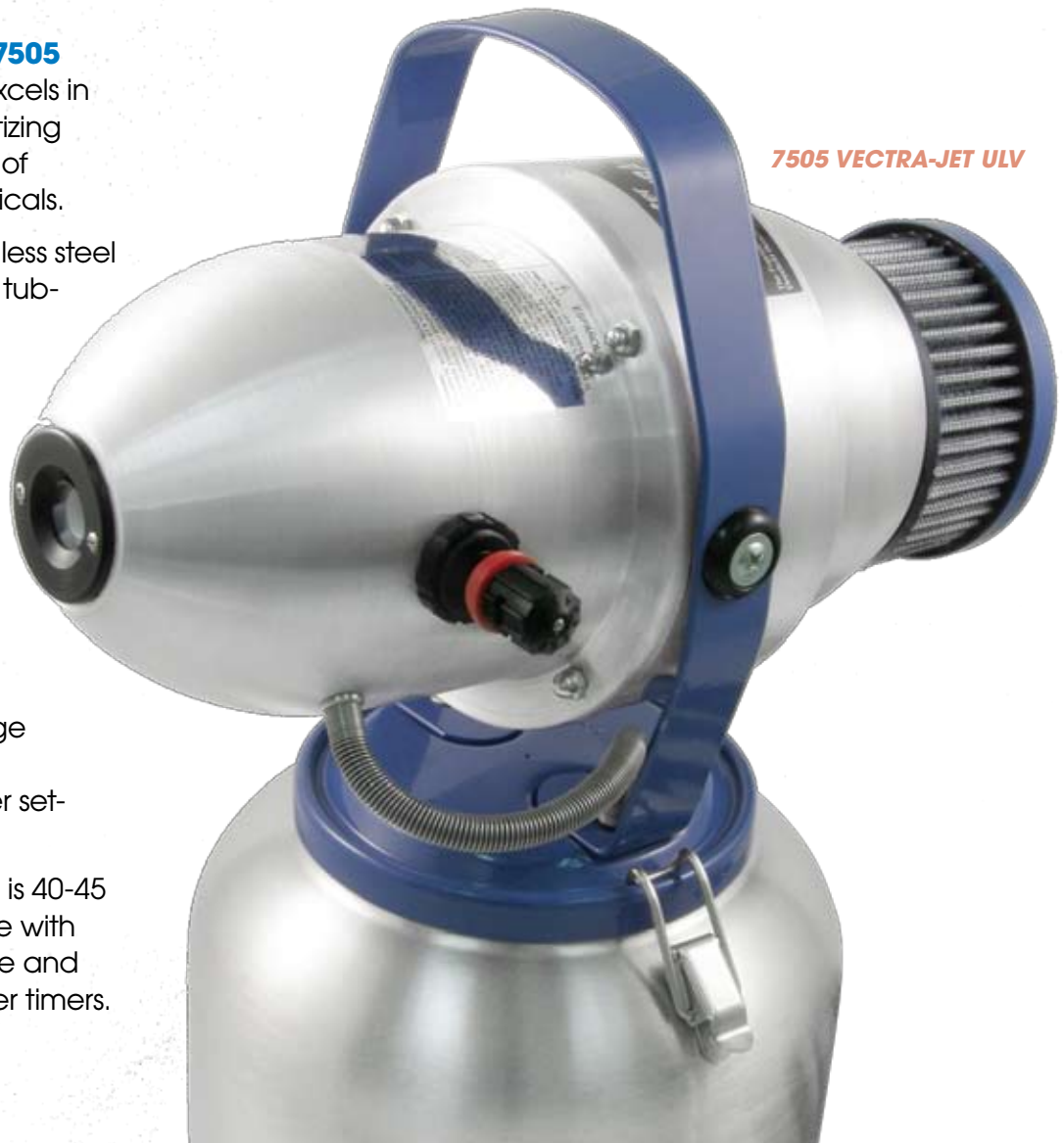
7505 VECTRA-JET ULV

Discharge range is 40-45 ft. It is compatible with the 6100 turntable and with all Fogmaster timers.