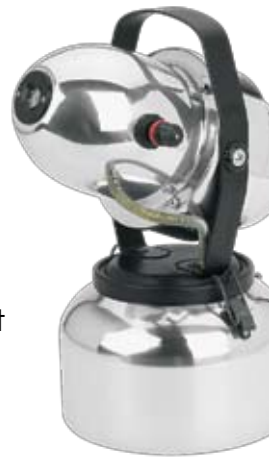
7401 MICRO-JET ULV

The Micro-Jet ULV is also available with a 2410 RH Controller (see Accessories) to humidify hobbyist greenhouses, small barrel rooms and plant propagation rooms.