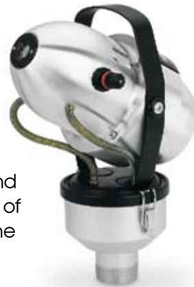
7421 MicroJet DM

landfills, sewage treatment plants, production agriculture and similar large sites.