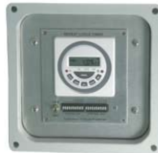
2239 Programmable Timer

Independent ON and OFF times can be set from 1-165 minutes. International plugs and receptacles available. 120 VAC (P/N 223910); 240 VAC (P/N 223920)