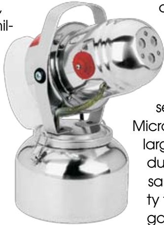
6208 FOGMASTER TRI-JET

Useful for both large and small areas, and of course for both water- and oil-based liquids, this workhorse controls flies and mosquitoes, sanitizes and disinfects, applies carpet mildew controls, and neutralizes odors, including flood and fire damage restoration. A one-turn valve controls droplet size. Fog droplets range from intermediate to heavy wet. Output distance is about 25 ft.