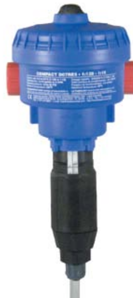
5250 PROPORTIONAL INJECTOR

Four models of the 5250 provide dilution capability from 1:5 down to 1:1500. Each has a